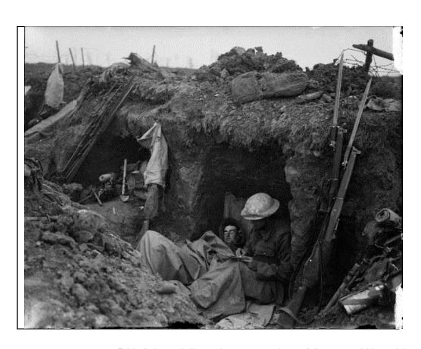
[Welsh soldiers in a trench at Mametz Wood in 1916]

Use Sources A, B and C above to identify one similarity and one difference in the use of tactics in battle over time. [4]