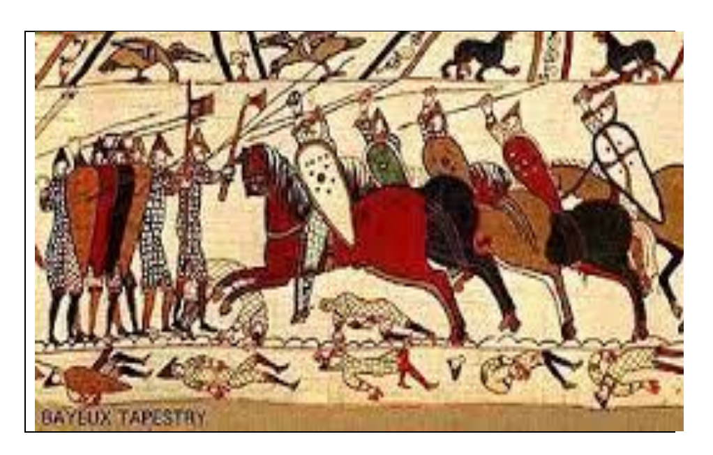
[Soldiers fighting at the Battle of Hastings in 1066]